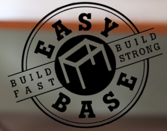
Table Legs .com

IMPORTANT: Read the directions and study the pictures - it makes all the difference.